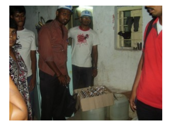
Agitation and closure of liquor outlets (belt shops)