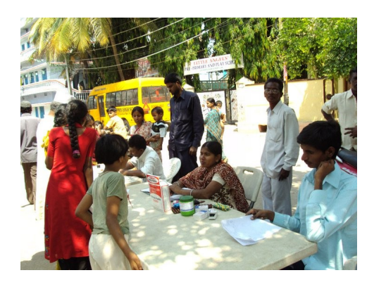
Mobile health service, first in AP, treated 705 people in a single day in 15 slums.